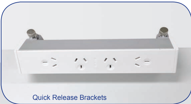
Quick Release Brackets