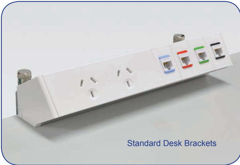
Standard Desk Brackets

The quick release bracket allows for above desk fixing/repositioning of the rail. This helps to avoid any OH&S issues of staff crawling under desks.