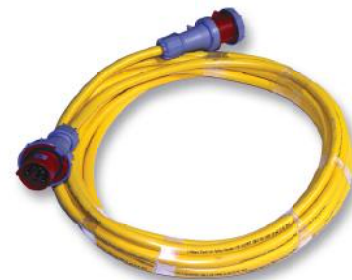
63A three phase lead