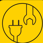
Hire & Service