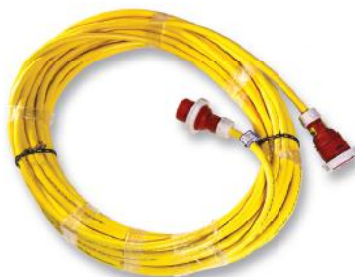
32A three phase lead