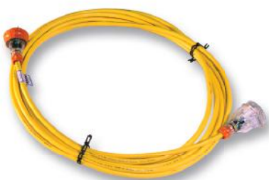
15A single phase lead