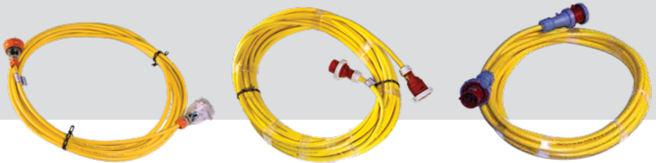
15A Single Phase Cable