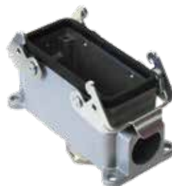
Bottom - 70.333.**28.0