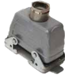
Top - 70.357.**28.0