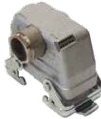
Broad Side - 70.356.**28.0