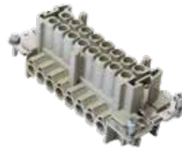
Female Insert - 70.300.**40.0