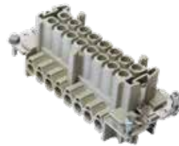
Female Insert - 70.300.**40.0