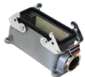
Narrow Side - 70.331.**28.0