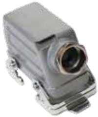
Narrow Side - 70.355.**28.0