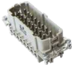
Male Insert - 70.310.**40.0