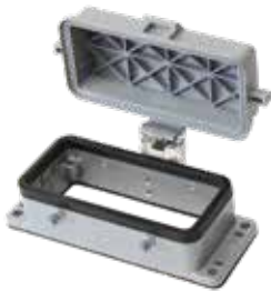
Open Bottom Lid - 70.325.**28.0