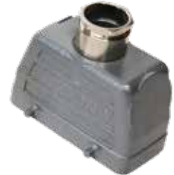
Top - 70.352.**28.0