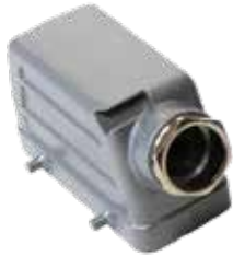
Narrow Side - 70.350.**28.0