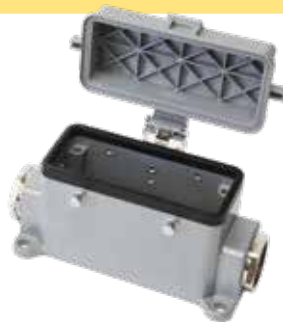
L - R Side Entry - 70.340.**28.0