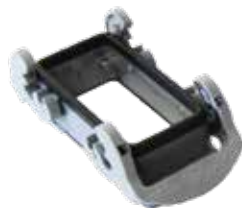
Open Bottom - 70.320.**28.0