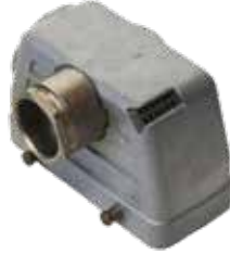
Broad Side - 70.351.**28.0